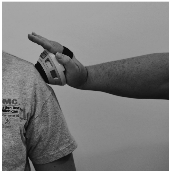
FIGURE 1. Positioning for lateral force application. The hand-held dynamometer was placed over the proximal tip of the acromion; force was applied perpendicular to the long axis of the trunk while the examiner maintained horizontal forearm alignment.